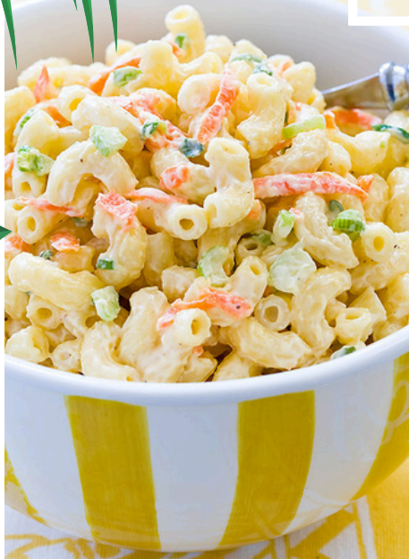
HAWAIIAN MAC SALAD