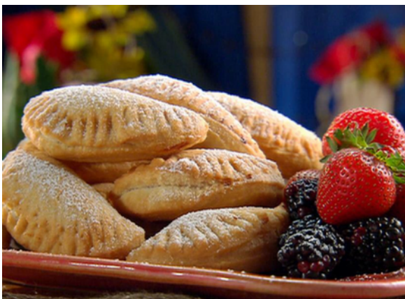
MINI FRUIT EMPENADAS