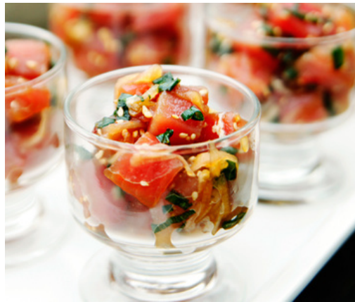
POKE CUPS, OR POKE BITES