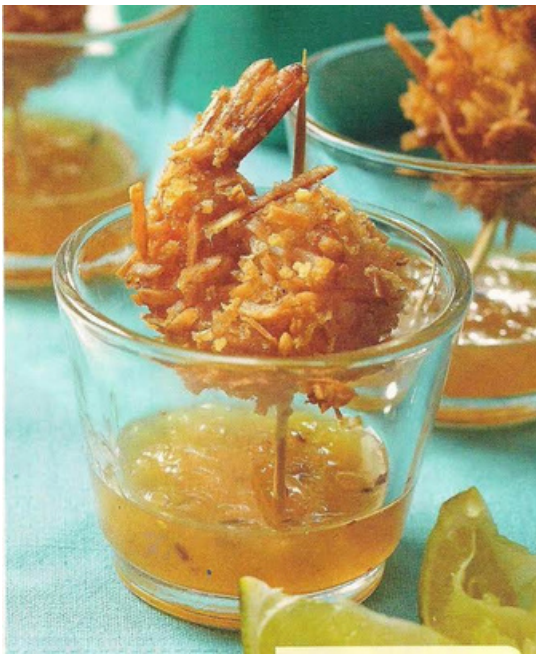
PINA COLADA COCONUT SHRIMP BITES