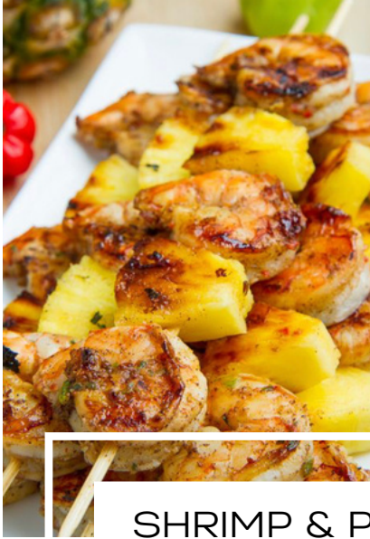
SHRIMP & PINEAPPLE SKEWERS