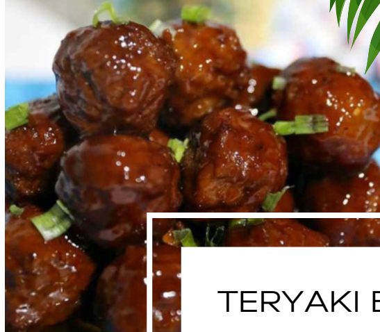
TERYAKI BBQ MEATBALLS